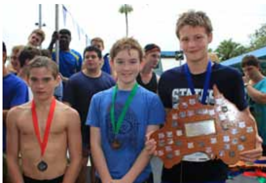
Left: 13 Years Age Champions: