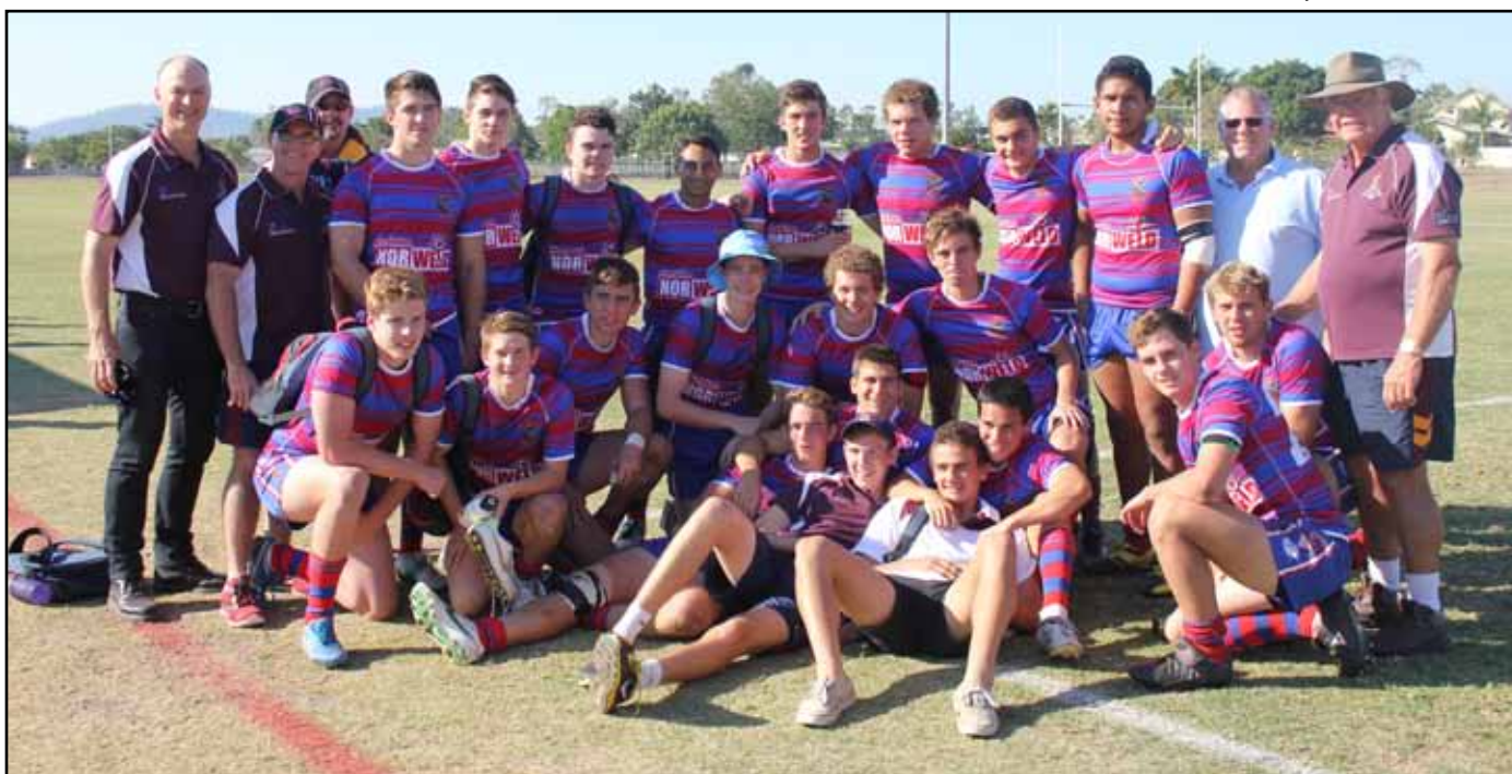
2013 Saints Confraternity team

If you have any stories to be submitted for our next edition please email us at oldboys@sac.qld.edu.au