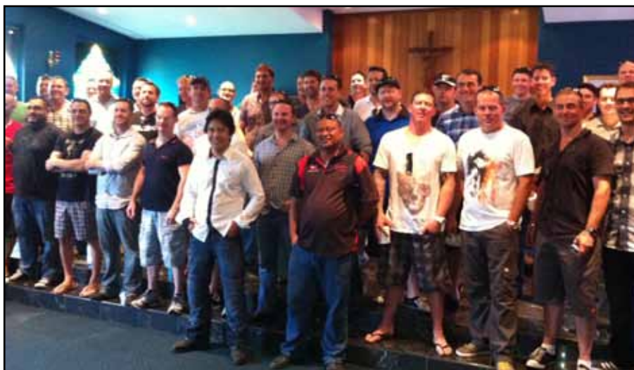
Class of 1993